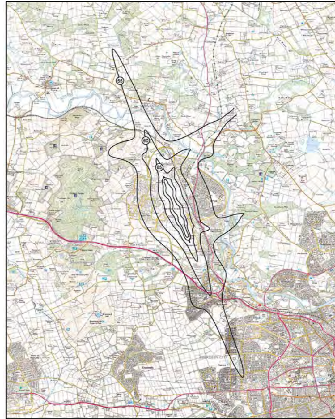
ABERDEEN INTERNATIONAL AIRPORT 2016 Annual Day L Aeq,16hr 55-75 dB(A) Noise Contours (Fixed-Wing + Helicopters) Actual Modal Splits: Fixed-Wing 52% S / 48% N, Helicopters 64% S / 36% N

© Crown Copyright and database right 2017. Ordnance Survey Licence number 100016105