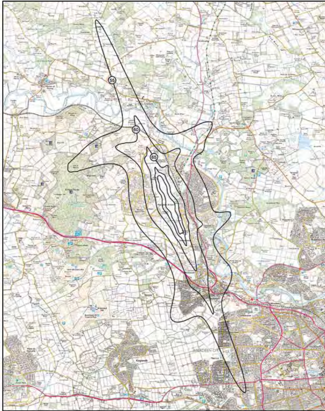
ABERDEEN INTERNATIONAL AIRPORT 2016 L den 55-75 dB(A) Noise Contours (Fixed-Wing + Helicopters) Actual Modal Splits: Fixed-Wing 52% S / 48% N, Helicopters 65% S / 35% N