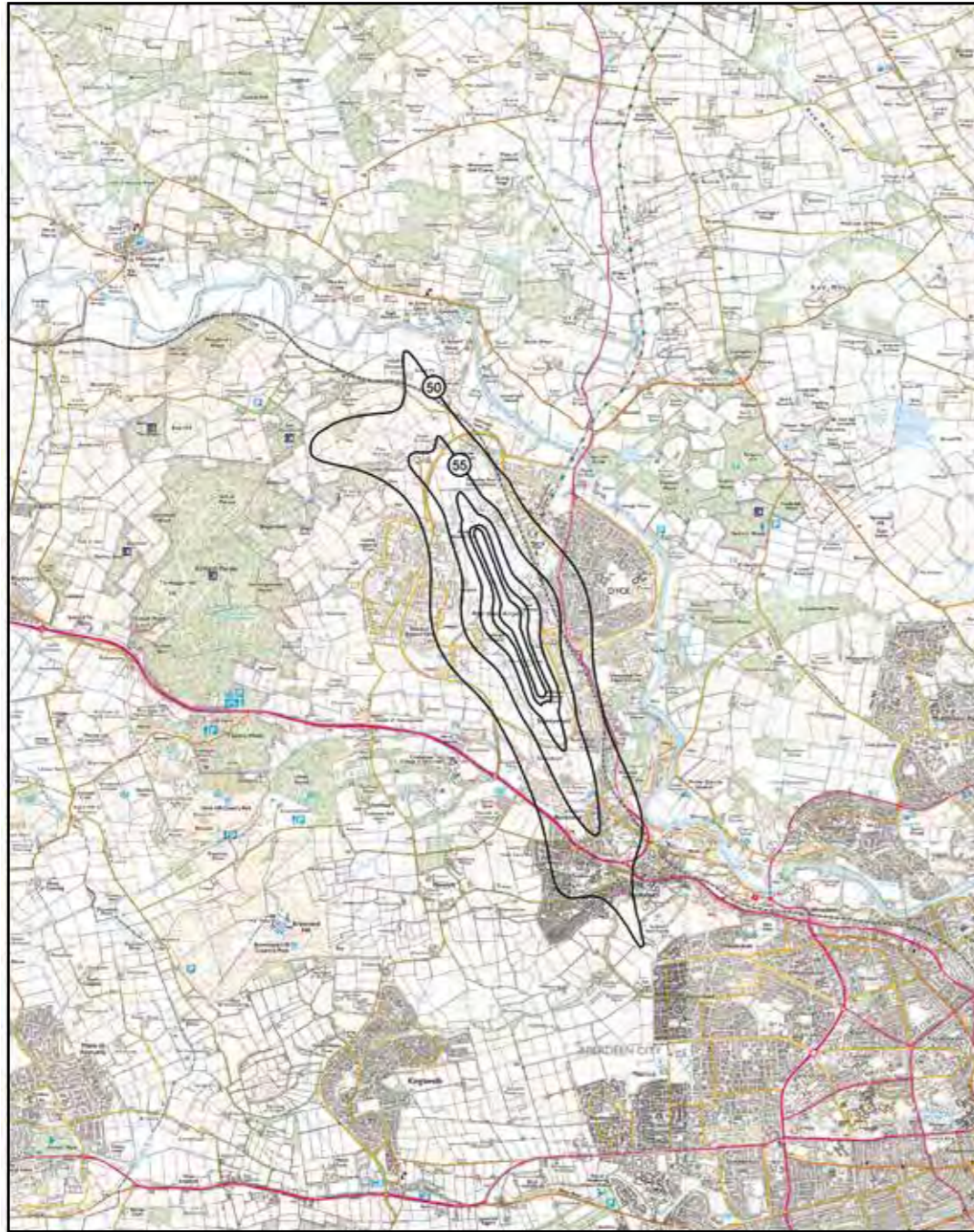
ABERDEEN INTERNATIONAL AIRPORT 2016 L night 50-70 dB(A) Noise Contours (Fixed-Wing + Helicopters) Actual Modal Splits: Fixed-Wing 49% S / 51% N, Helicopters 73% S / 27% N

© Crown Copyright and database right 2017. Ordnance Survey Licence number 100016105